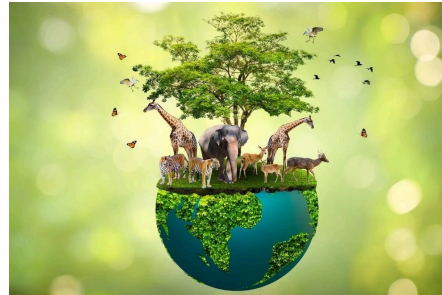
Byd Bendigedig - Wonderful World